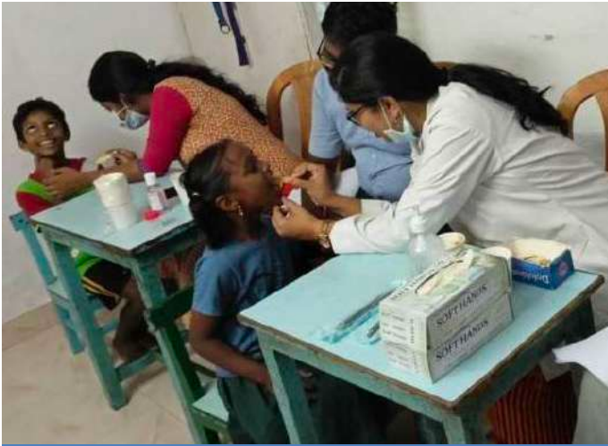
Dental Screening at Chemmencherry CBR Centre