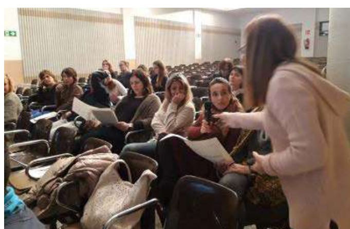
Training Session - SG Torroella de Montgrí