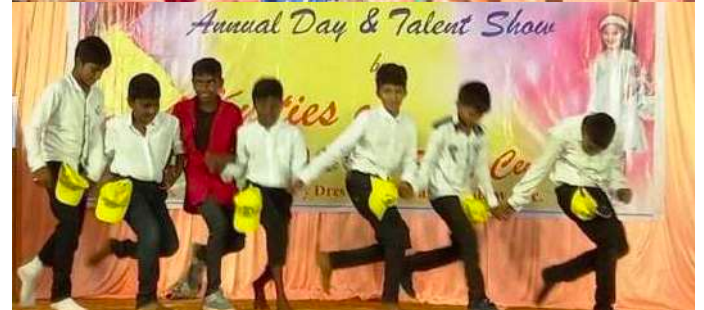
Photo: Dance performance during Annual Day Celebrations by Study Centre Children

Dental Screening and Awareness camps were held for the children at Chemmencherry Study Centres and about Sixty students availed this opportunity. This camp was conducted in association with Sathyabhama Dental College. The Children were busy with their preparations for the Final Examinations.