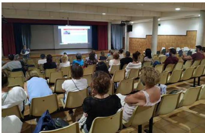
Session on personal growth - SG - Ripollet