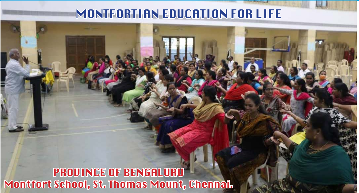
PROVINCE OF BENGALURU Montfort School, St. Thomas Mount, Chennai.