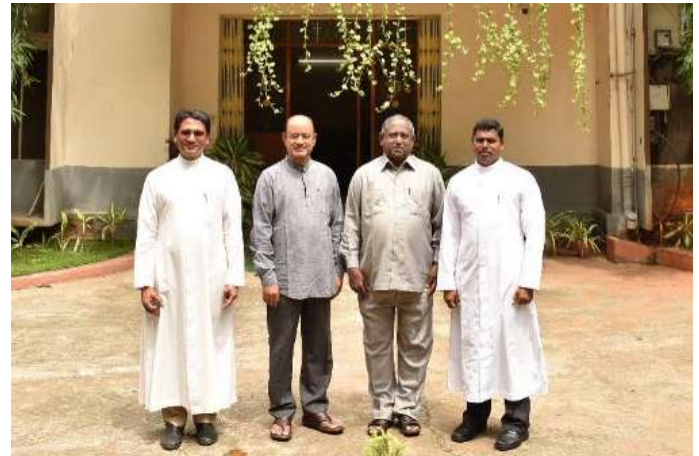
Photo: Little Flower Community members.