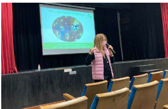
Formation Session - SG - Aranda de Duero - Roa