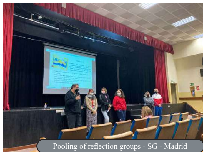
Pooling of reflection groups - SG - Madrid