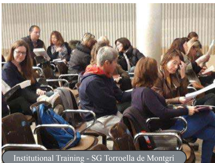
Institutional Training - SG Torroella de Montgrí