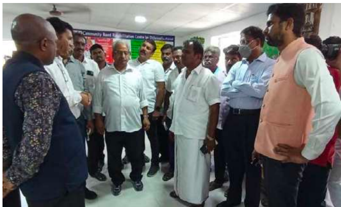
Sholinganallur MLA is introduced to the facilities in our Kannagi Nagar.