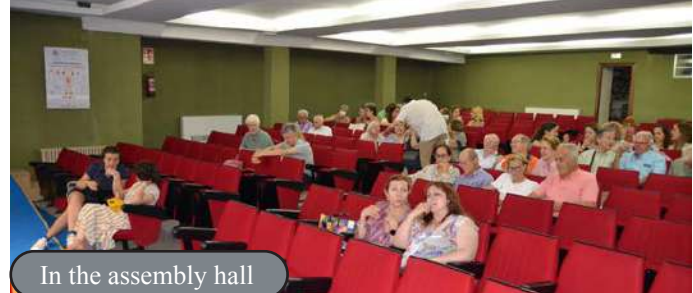
In the assembly hall