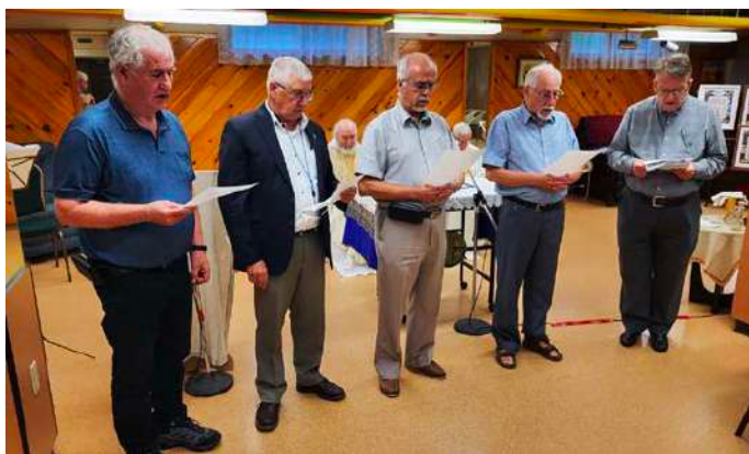
5 members of the Provincial Administration