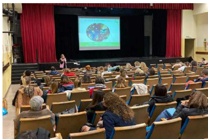
Session Transformation of the world - SG - Madrid