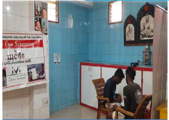
Eye Screening Camp in progress

Thousand and Three hundred beneficiaries in our predetermined areas in the Slums and Slum relocated areas during this reporting period.