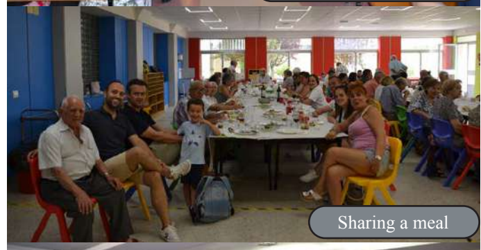
Sharing a meal