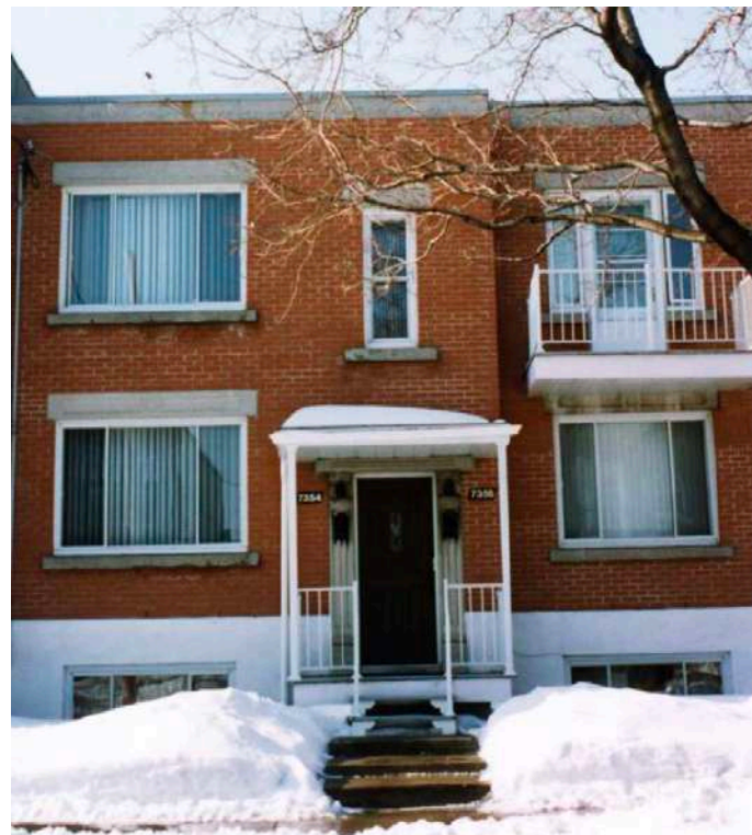
The house that was sold

joined the Community of Saint-Nicolas and the other joined the Community of the Provincial House. These two brave men deserve our congratulations for the hard work they did to empty the house they were leaving. The Brothers of St. Gabriel have owned that house for 46 years. From now on, there will remain, in Quebec, 4 Local Communities: 1 (Saint-Lazare) in Cap-de-la-Madeleine, and 3 others in Montreal (Saint-Nicolas, Garnier and Provincial House).