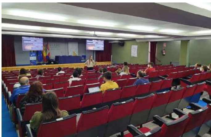
Session Gabrielist Legacy - SG - Aranda de Duero - Roa