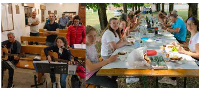
The prayer group "Regina della Pace" has its regular biweekly prayer meetings and recently they arranged a picnic at Ca' Florens with their children. They had