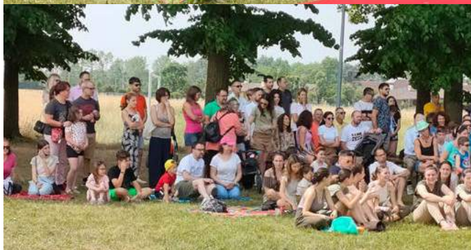
On Saturday 4 and Sunday 5 June we had an annual closing ceremony of about 400 dancing students. These were really marvellous days of dancing for students, their teachers and their parents. The programme was conducted outside in the meadows and the spectacular avenue of limes trees (tigli).