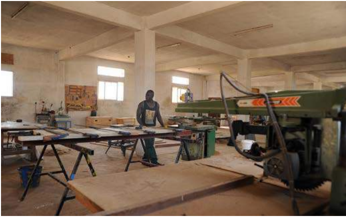
At the Tivaouane-Peulh carpentry workshop