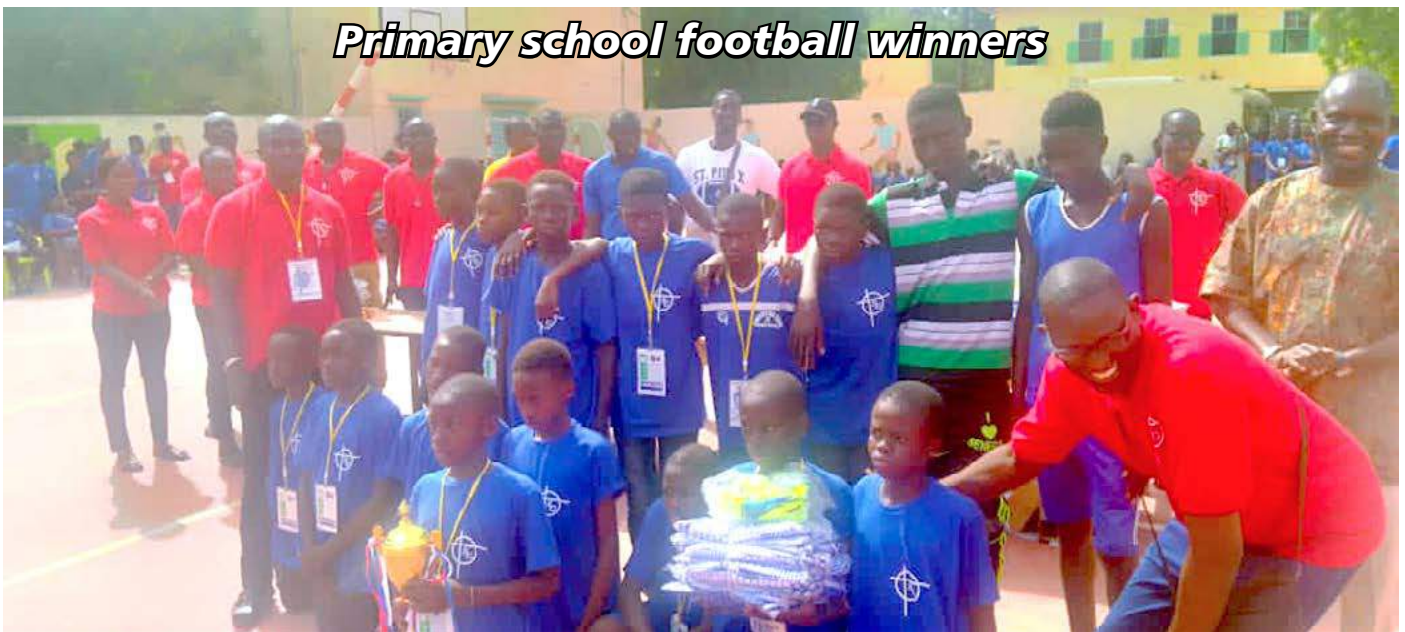
Primary school football winners