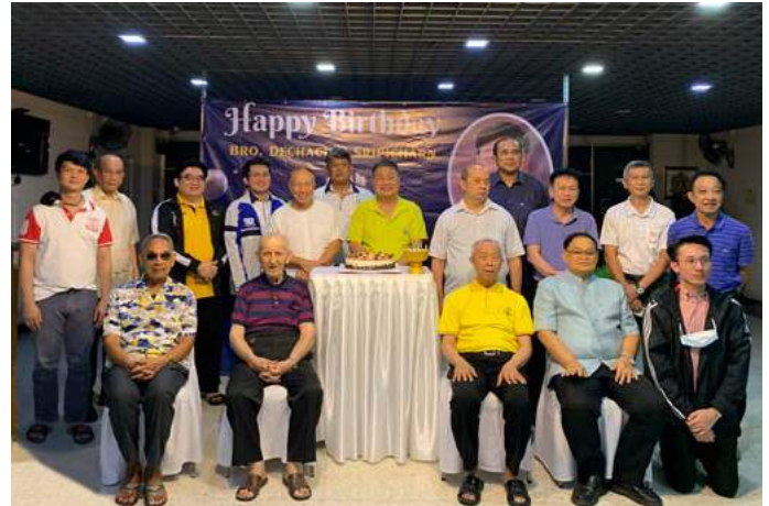
Commemorating the Joyful Birthday of Our Provincial Superior