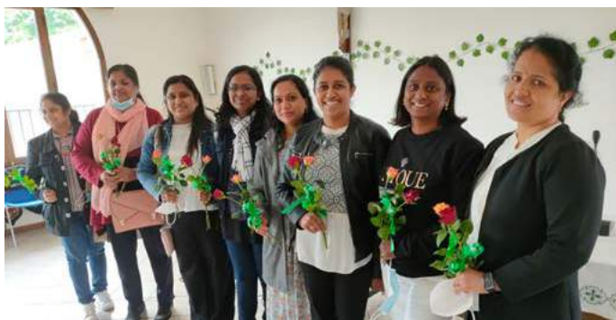
The Indian Catholic Syro-Malabar community has its regular Holy Mass celebration in our Institute. They also had celebrated the International Mothers' Day.