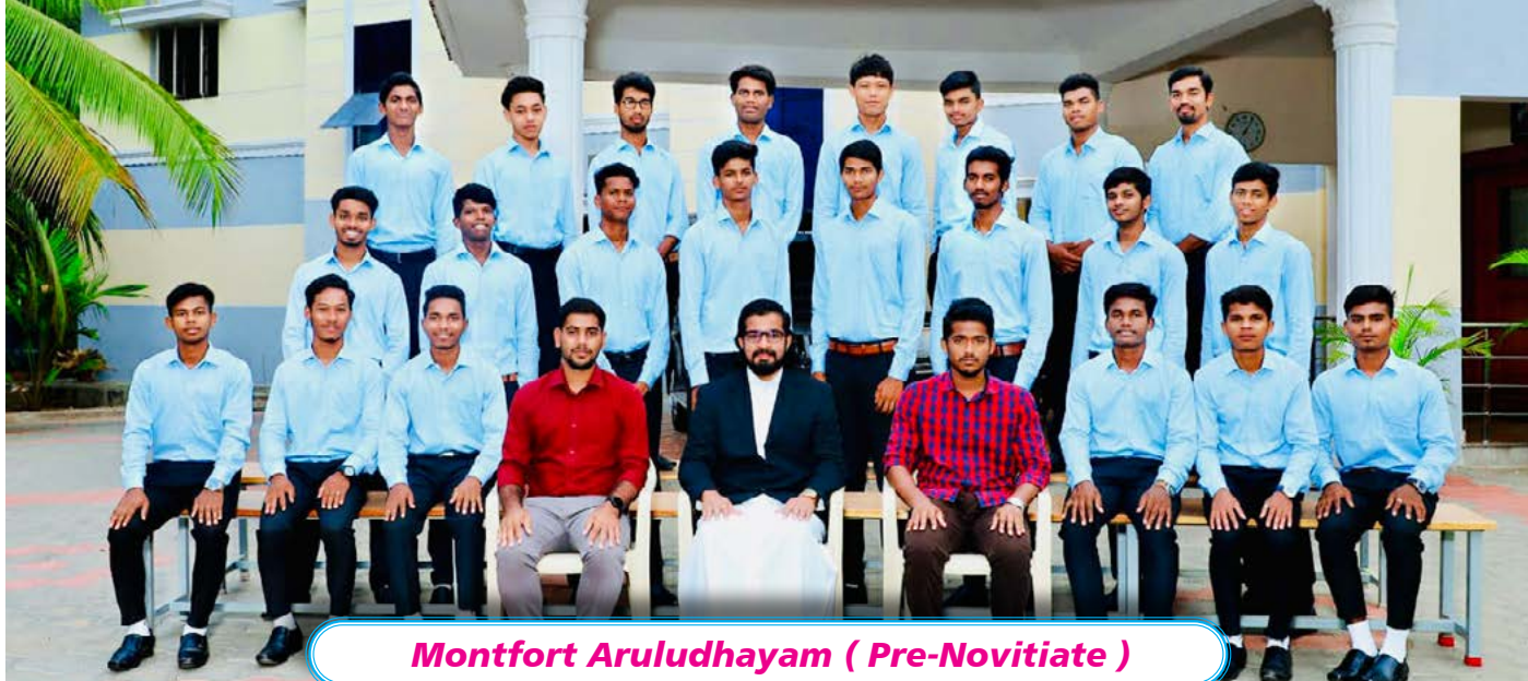
Montfort Aruludhayam ( Pre-Novitiate )

W e are very much excited and privileged to describe the events that occurred in the month of April, at Aruludhayam.