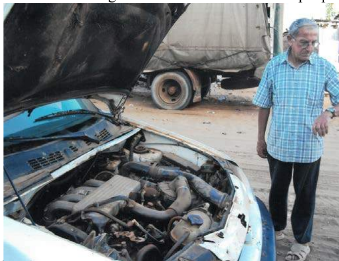
... broken down car in Malika... it takes a little time to wait for the repair... Patience is required!!!

The attitude of the young people toward the mission and their unreadiness to collaborate reflected Sékou Touré's 35 years of Marxist dictatorship: mistrust, opposition to anything foreign, and certain laziness. The number of our students decreased going from 15 to 7. We supported the 7 students helping them to resettle in the village working as farmers and carpenters. Our community was reduced to 3 Brothers: two Senegalese and myself. We enjoyed neither running water, TV nor telephone. We had only a solar panel to lighten the house!