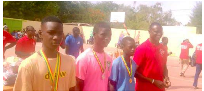
Triple jump men Winners' Podium

Middle School boys competed in football, sprint, and triple jump, while girls faced each other in handball, relay, sprint, and triple jump.