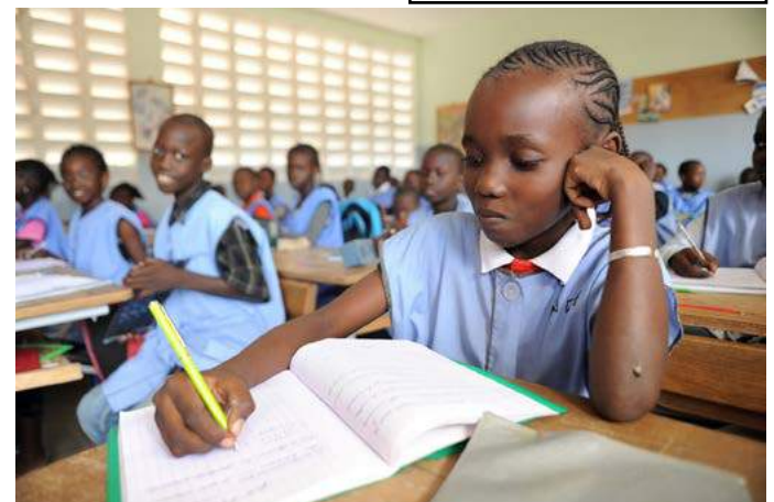
School children in Malika