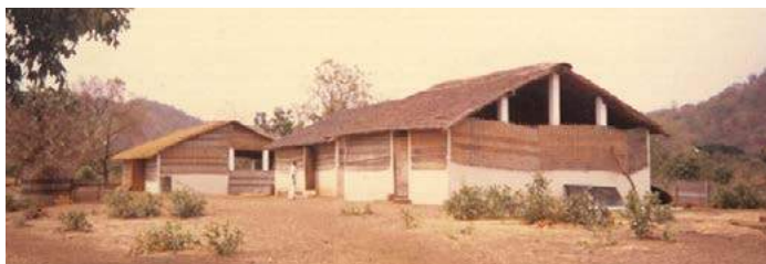
In Salémata, the building of the Agricultural and development training center was made possible by donations from Misereor, a charity German charity run by the Catholic Church.