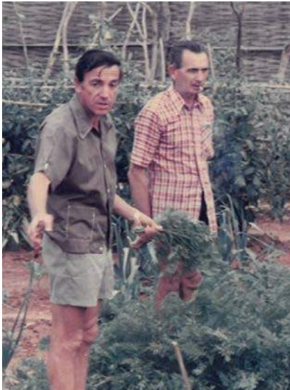
In Salémata, transportation of water from the school garden!

The agricultural training was also conducted in about 20 villages. I was in charge of open-field agriculture during the rainy season. We worked with the means and tools that came at hand including equipped carts with brakes, which were very useful in this hilly country. We utilized different methods such as oxen-