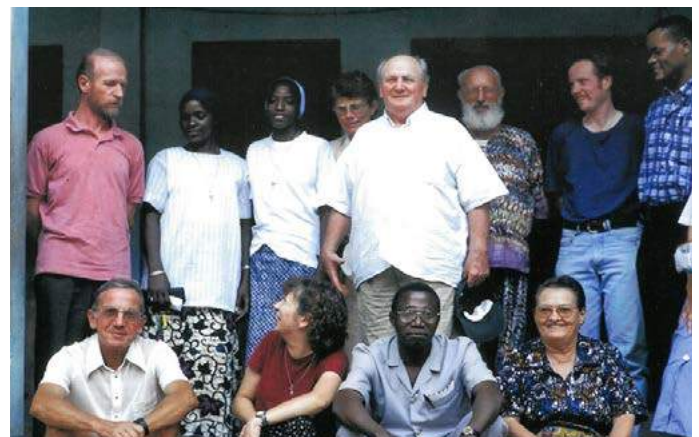
The Parish apostolic teams of Salémata, Ourous and Koundara