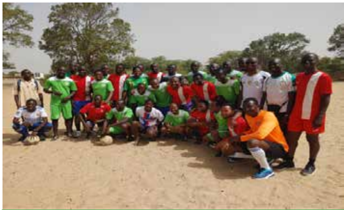
Group photo of the 2 teams