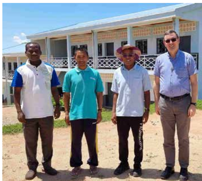
Visit to the new Antsirabe school