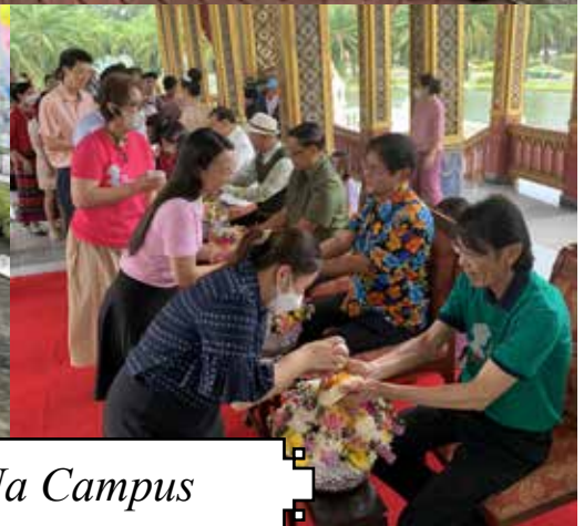
Songkran at Hua Mak Campus and Bang Na Campus