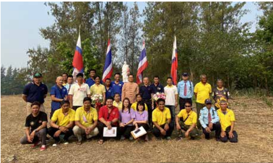
Unveiling the statue of St. Joseph