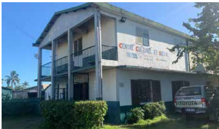
Community of the Brothers of Saint-Gabriel in Tamatave