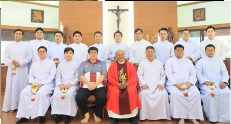
Young Brothers renew the vows this year