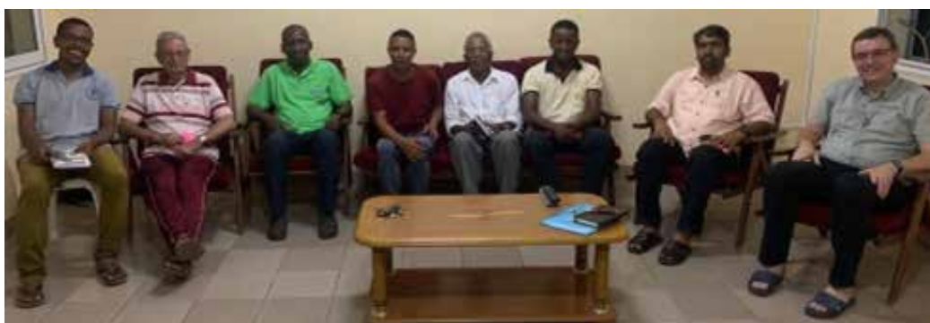
Community of Mahajanga