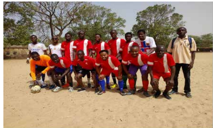
St. Gabriel TEAM