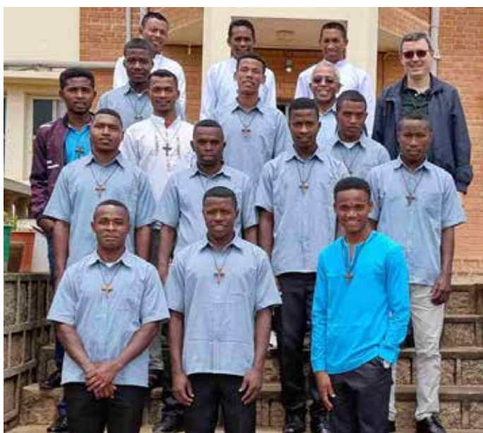
Photo of the group of young candidates and trainees