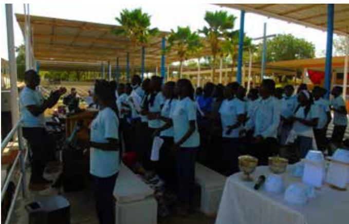
the choir of the Institution Saint Louis Marie de Grignon College (Malika)