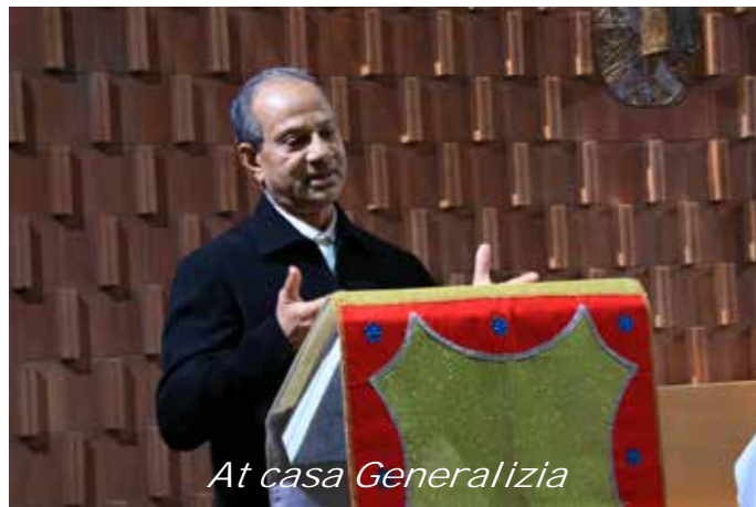
At casa Generalizia