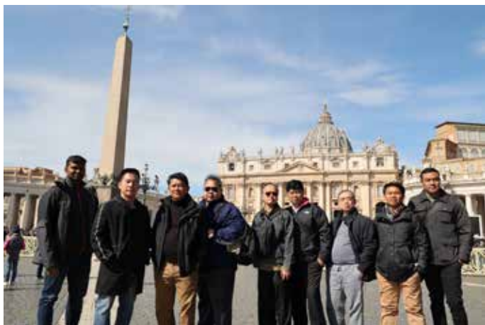
At St. Peter's Square