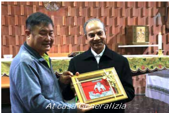
At casa Generalizia