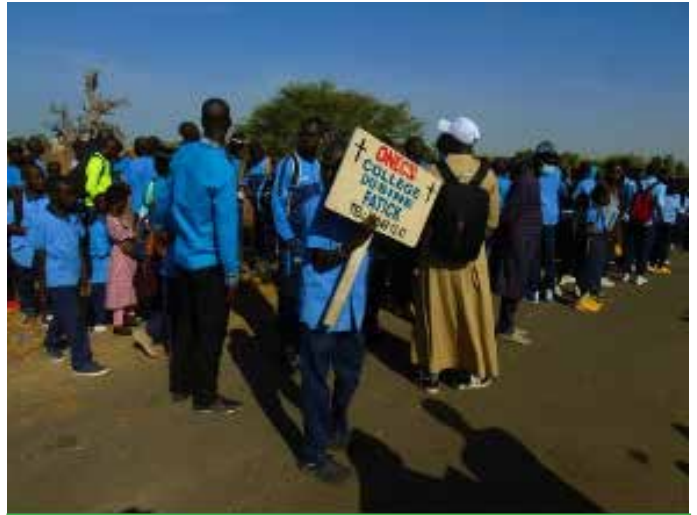
A part of the delegation of the College of Sine (Fatick)