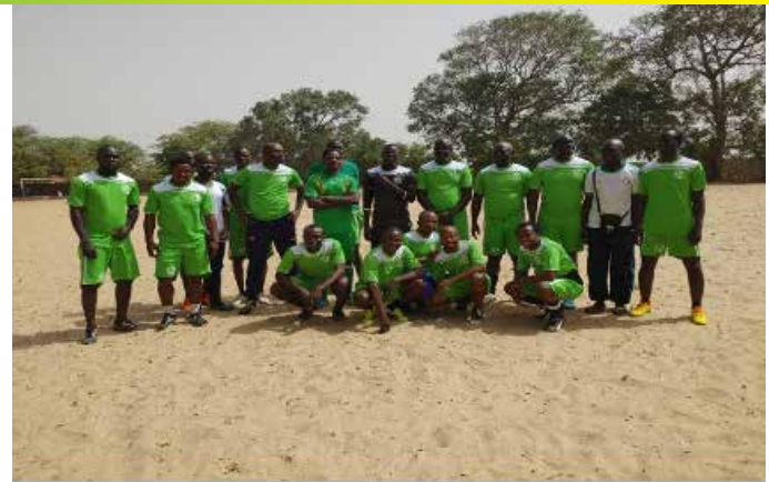
Sacred Heart Team