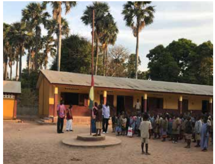
The School of Ourous