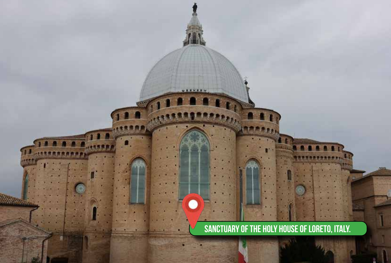
SANCTUARY OF THE HOLY HOUSE OF LORETO, ITALY.