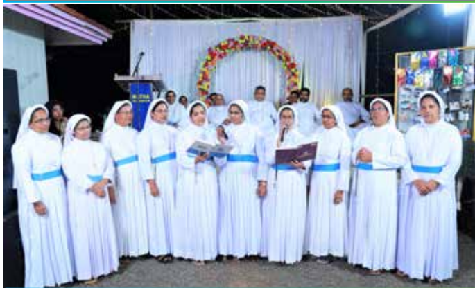
Nazareth Bhavan Sisters of Kunnoth