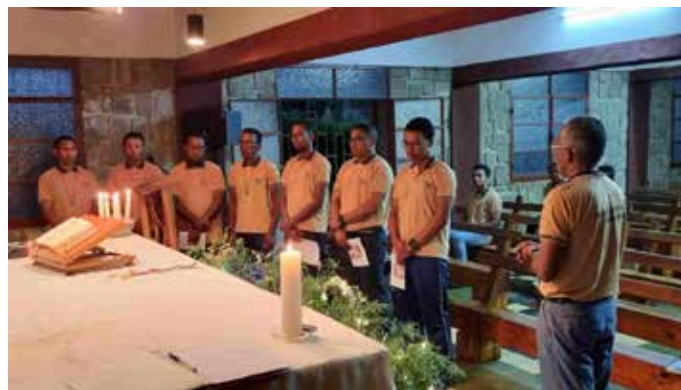
Renewal of vows ceremony in Antananarivo during the chapter in December 2022

It's always impressive for us coming from the West, (where society has grown older and births are declining) to see the sheer number of children and young people. Children are everywhere, some