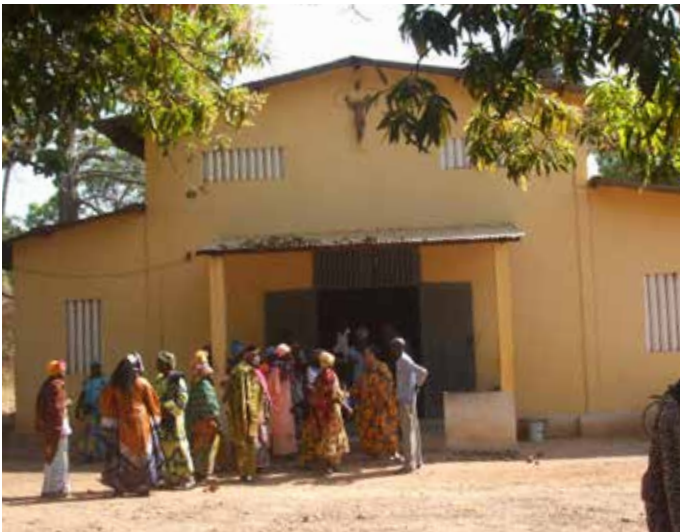
The Church of Ourous

of the 1998-1999 school year, he spent some time in Ourous and together we visited the neighboring rural schools. At the end of May 1999, together we held the last pedagogical formation meeting of the year, and officially he took over the responsibility of the schools of the Ourous Mission. On the afternoon of the meeting, a swarm of bees, no doubt disturbed, attacked me and stung me on my neck, arms, and face: I lay down to see what would happen, how the body would react: no swelling, little discomfort... Fortunately! The Lord takes care of his children, and I really gave thanks for his protection that day. I would like to thank God for all these years spent in Bassari country, in the missions of Salemata and Ourous, where I often travelled alone without being worried.