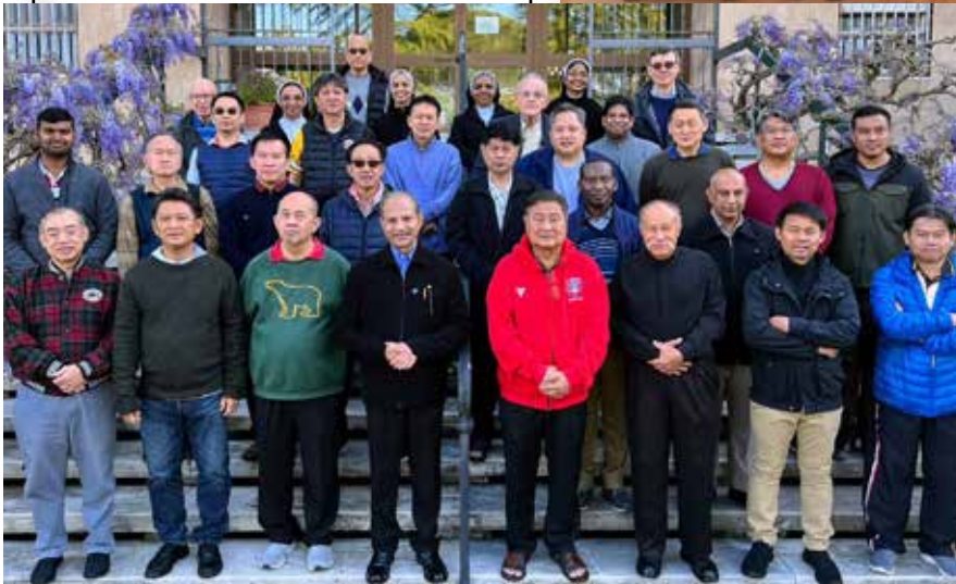
Superiors and Directors joining the Pilgrimage to Rome and France