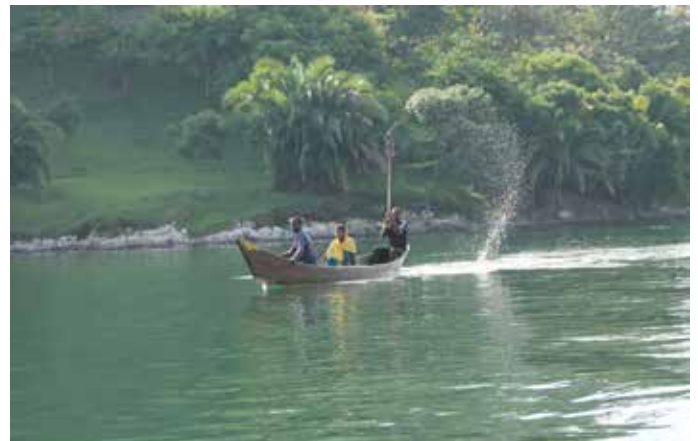
On Lake Kiou, Rwanda