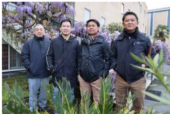
At casa Generalizia