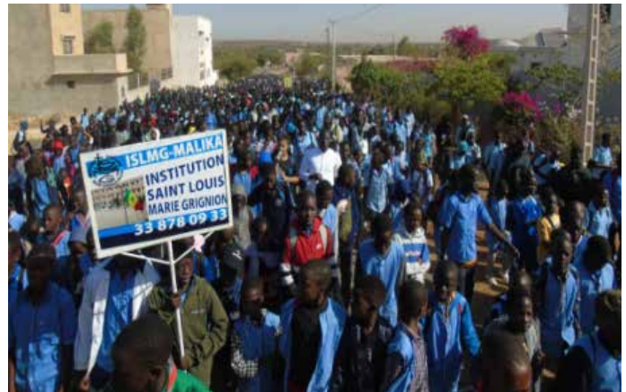
Rosary meditated during the march to the shrine