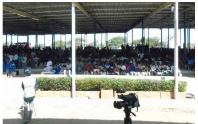
Part of the congregation during the celebration