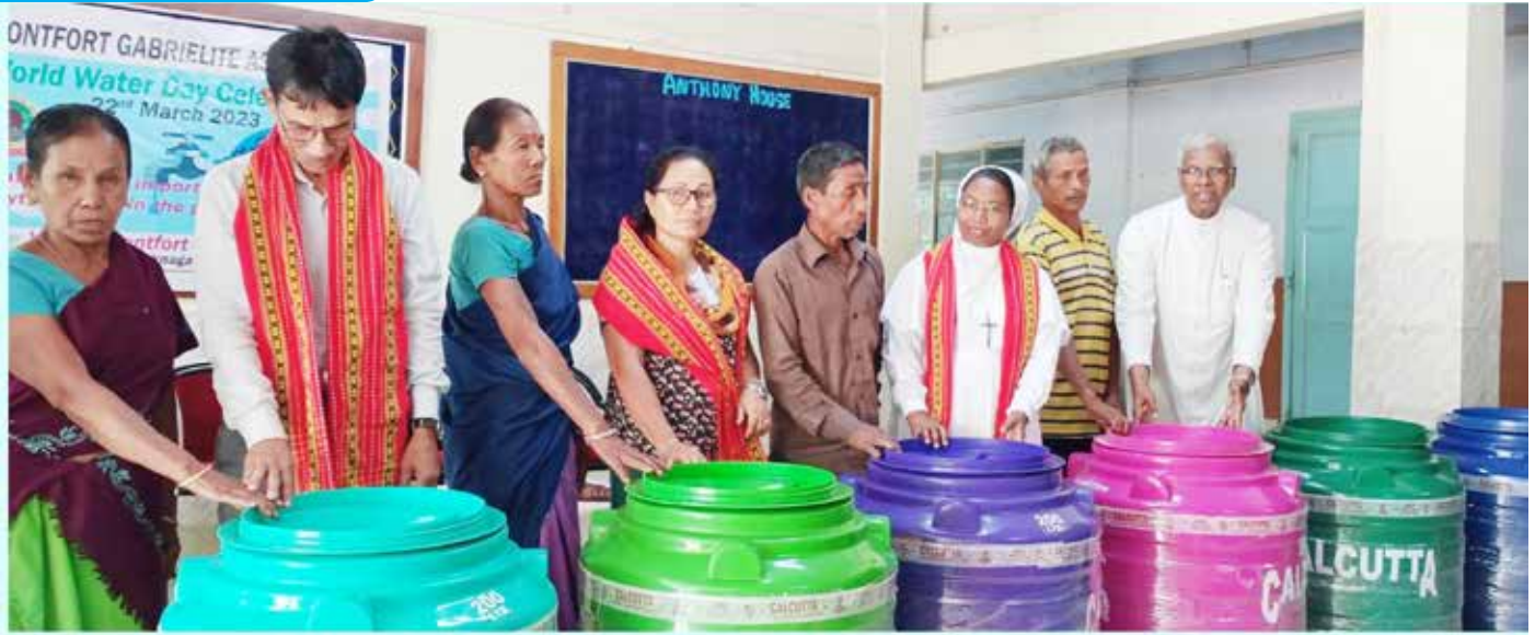
31 poor families were given a 200 liters water tank each