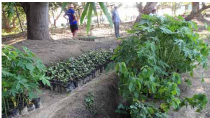
The lands of Belobaka