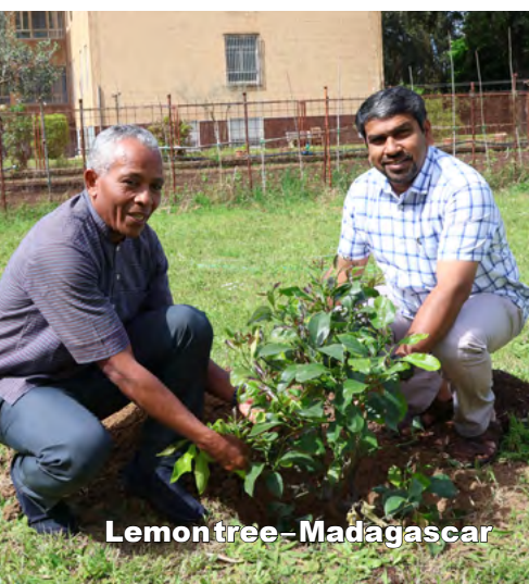
Lemon tree – Madagascar