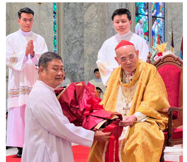
Bouquet of thanks from Rev. Bro. Provincial to Rev. Cardinal Meechai for coming to preside over the ceremony.