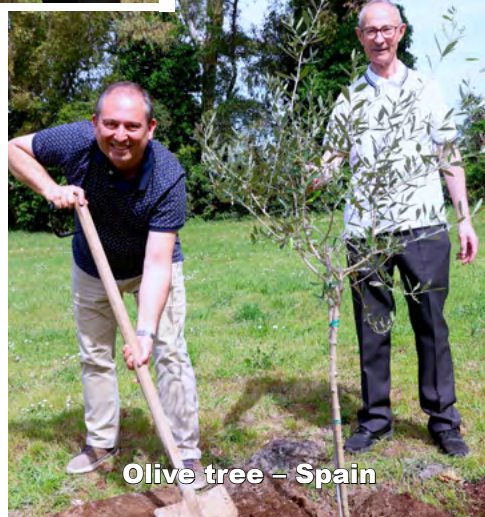
Olive tree – Spain