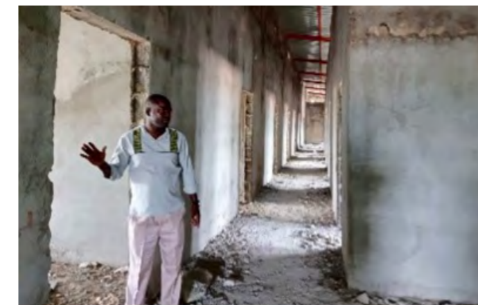
Visit of the buildings for Scout Boys