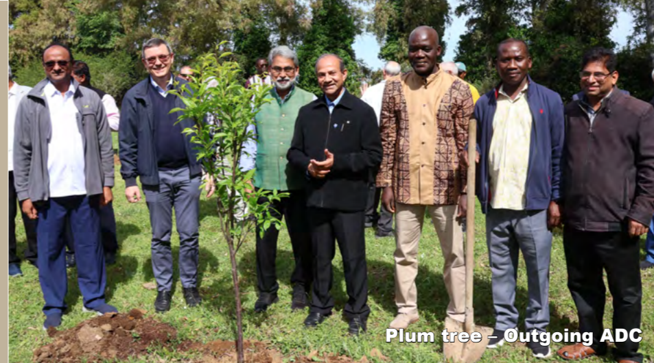
Plum tree – Outgoing ADC