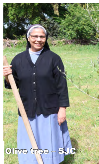
Olive tree – SJC