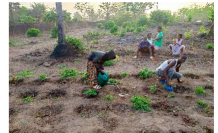
The great hall of Katakodi