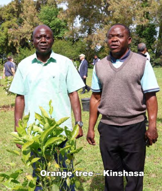
Orange tree – Kinshasa