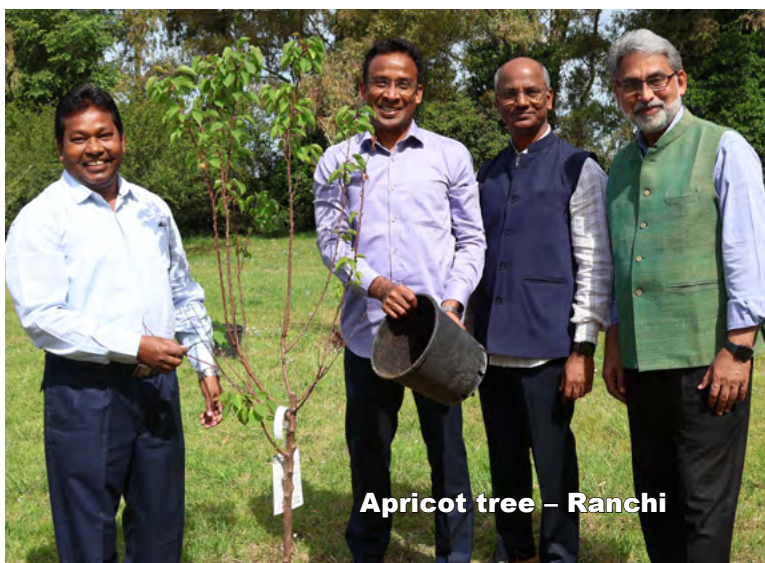
Apricot tree – Ranchi