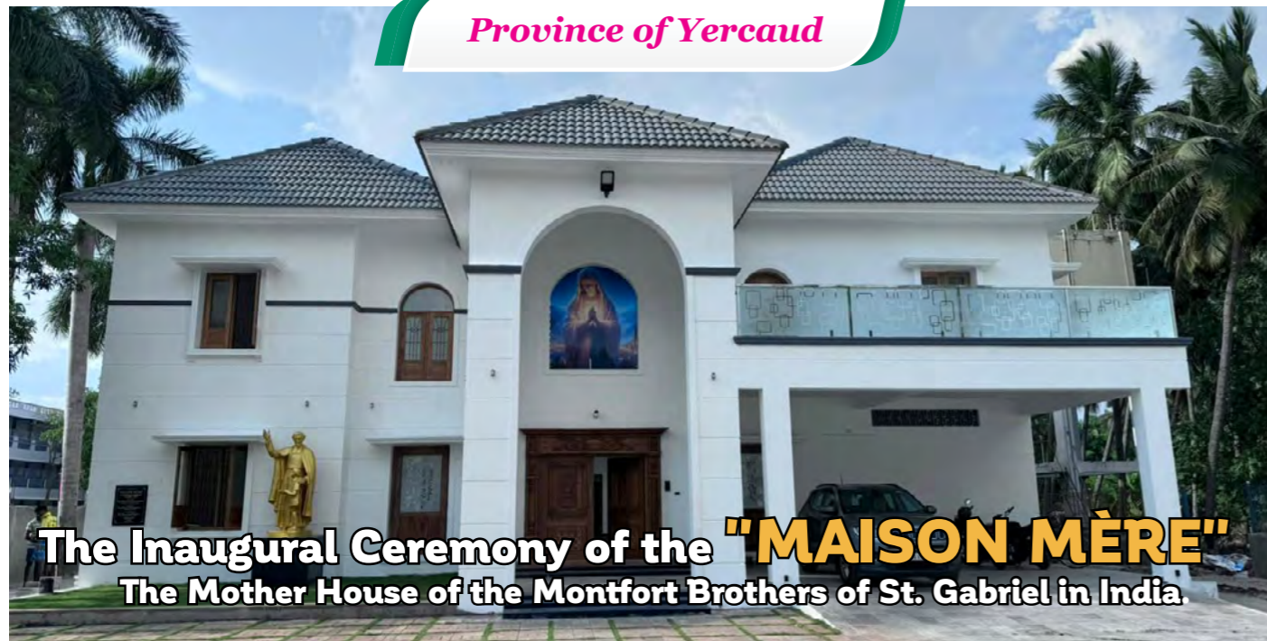
The Inaugural Ceremony of the "MAISON MÈRE" The Mother House of the Montfort Brothers of St. Gabriel in India.