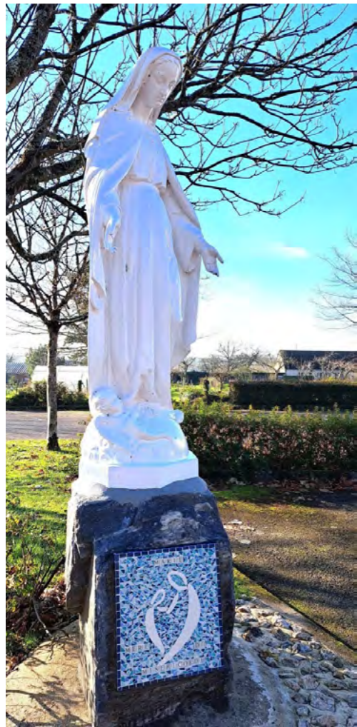
Statue on the path of consolation in Pontchâteau

Colombes at Saint Urbain Parish, to be completed in 2019, and the 4 th at the Calvaire de Pontchâteau.