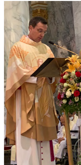
Secretary and Deputy Head of Mission Apostolic Nunciature, conveying his message.