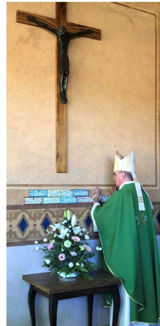
The name tags with the child's name, are placed at the foot of the altar at the foot of the altar during the Eucharist.