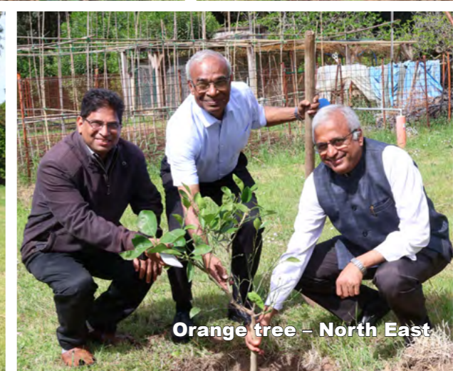
Orange tree – North East