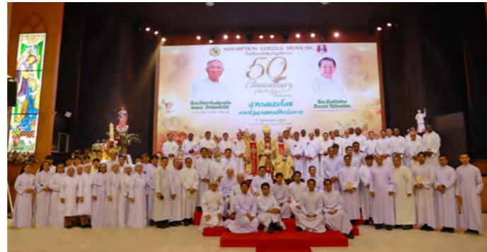
Group photo after the celebration.