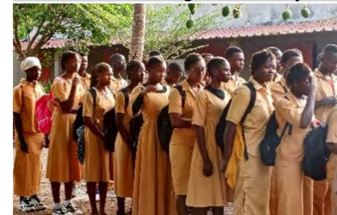
A group of students from Katakodi cooperants' residence