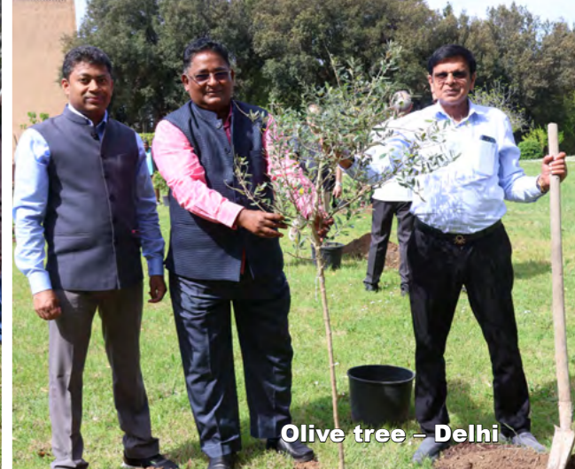
Olive tree – Delhi