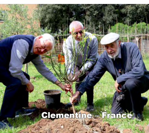
Clementine – France