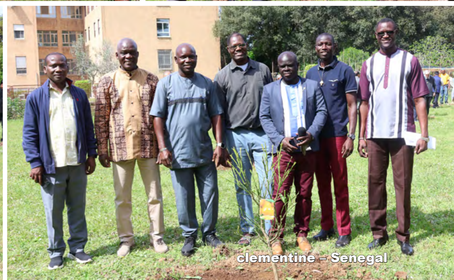
clementine – Senegal