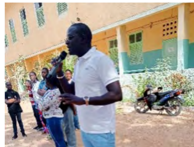
Welcoming address by the Principle

He finally invited everyone to be vigilant about the cleanliness of the site and the good use of the facilities made at the disposal of the delegations. After these opening words, we began the various competitions on the Saturday morning.