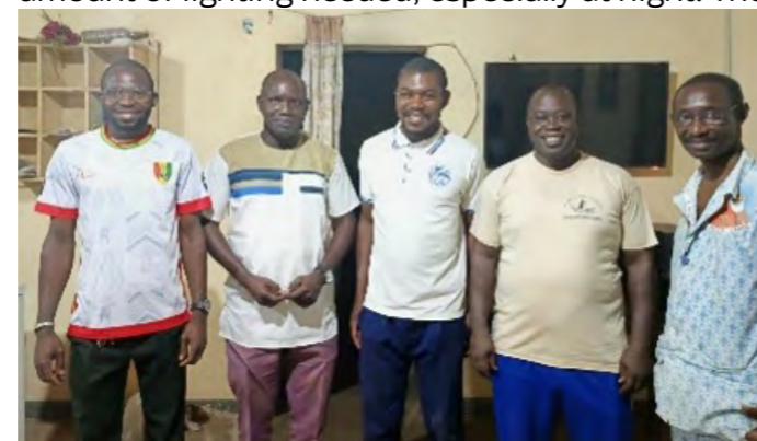
With the Ourous community

The electricity network is almost non-existent. Only the major towns have an electricity line. For lighting and other electricity needs, most households have solar panels. Our communities are no exception. They too are in this situation. What's more, our solar installations are used by the community, the school and the boarding school. Overuse drastically reduces their lifespan and the amount of lighting needed, especially at night. The