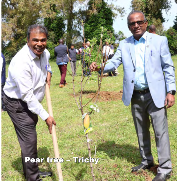
Pear tree – Trichy