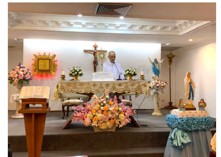
The Holy Hour and invocation of the Holy Spirit.

On the 20 th afternoon, the committee invited experts from RIS School to give a talk on "Child abuse and safeguarding" with some exercises on the topic. We profited greatly from this half-a-day meeting.