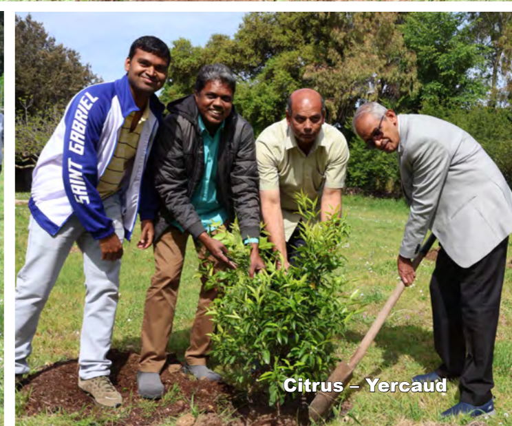
Citrus – Yercaud