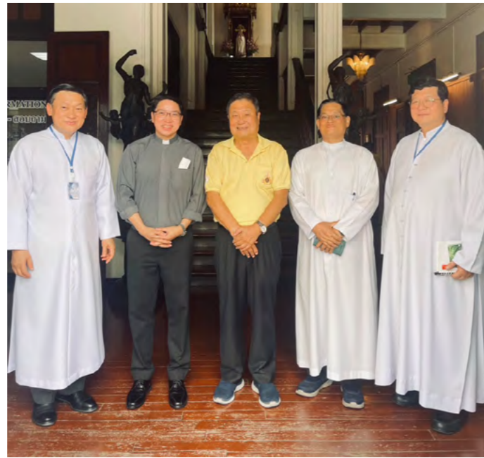
Purposive Discussions Towards Sustaining High Catholic Educational Standards in Thailand

On Friday, April 26, 2024, HRH Princess Maha Chakri Sirindhorn awarded honourable mention of the ASA Conservation Award for Architecture and Community Heritage Conservation 2020-2021 to MARTIN DE TOURS building Saint Gabriel's College, Bangkok, which was selected by the Association of Siamese Architects under Royal Patronage.