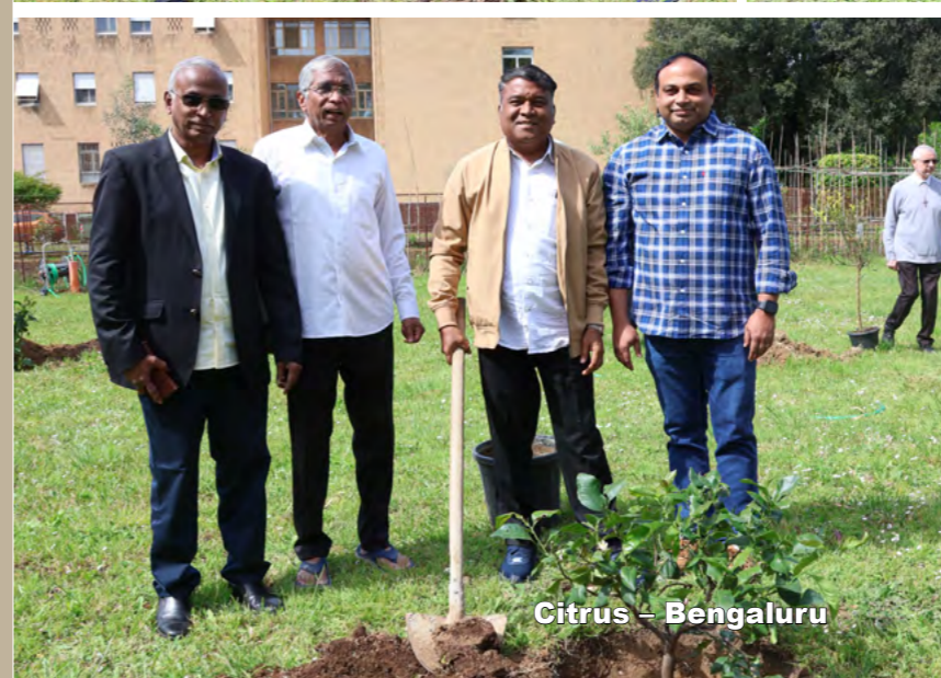
Citrus – Bengaluru