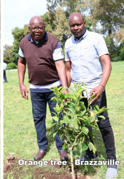
Orange tree – Brazzaville