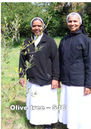
Olive tree – SJC