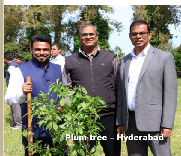
Plum tree – Hyderabad