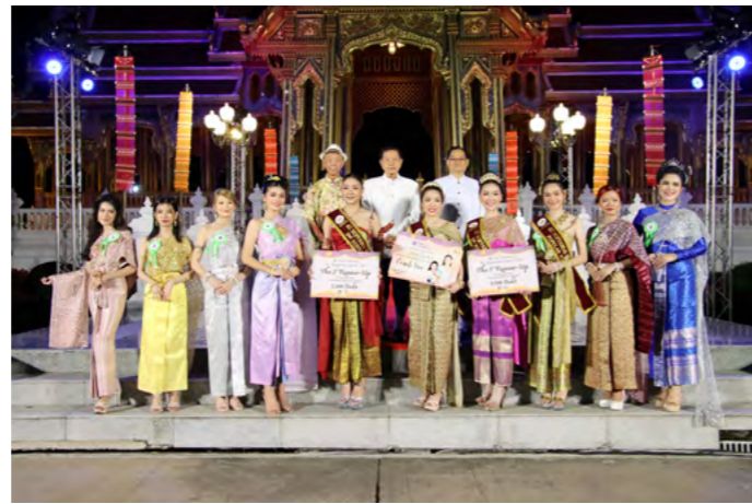
Loy Krathong at Hua Mak Campus