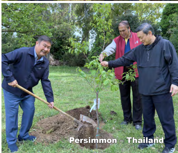
Persimmon – Thailand