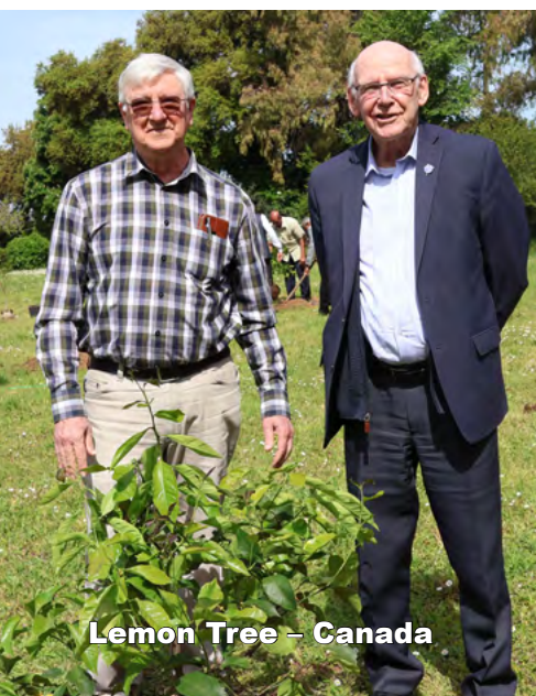
Lemon Tree – Canada