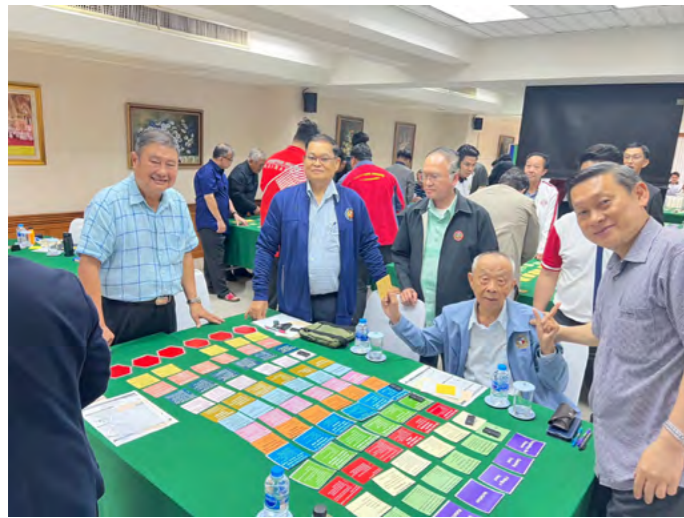
Some exercises about child abuse and safe guarding.