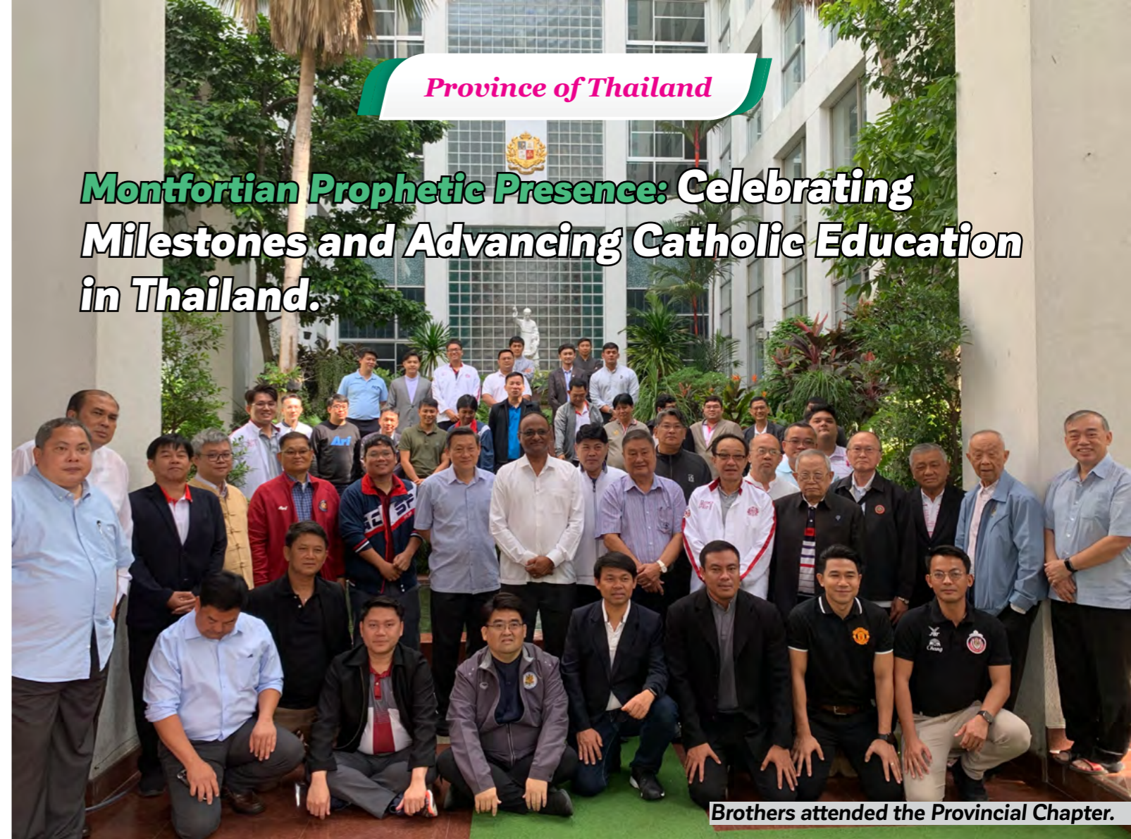
Brothers attended the Provincial Chapter.