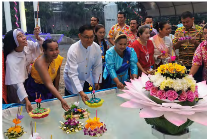
Loy Krathong at Suvarnabhumi Campus