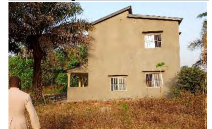
From Katakodi katako