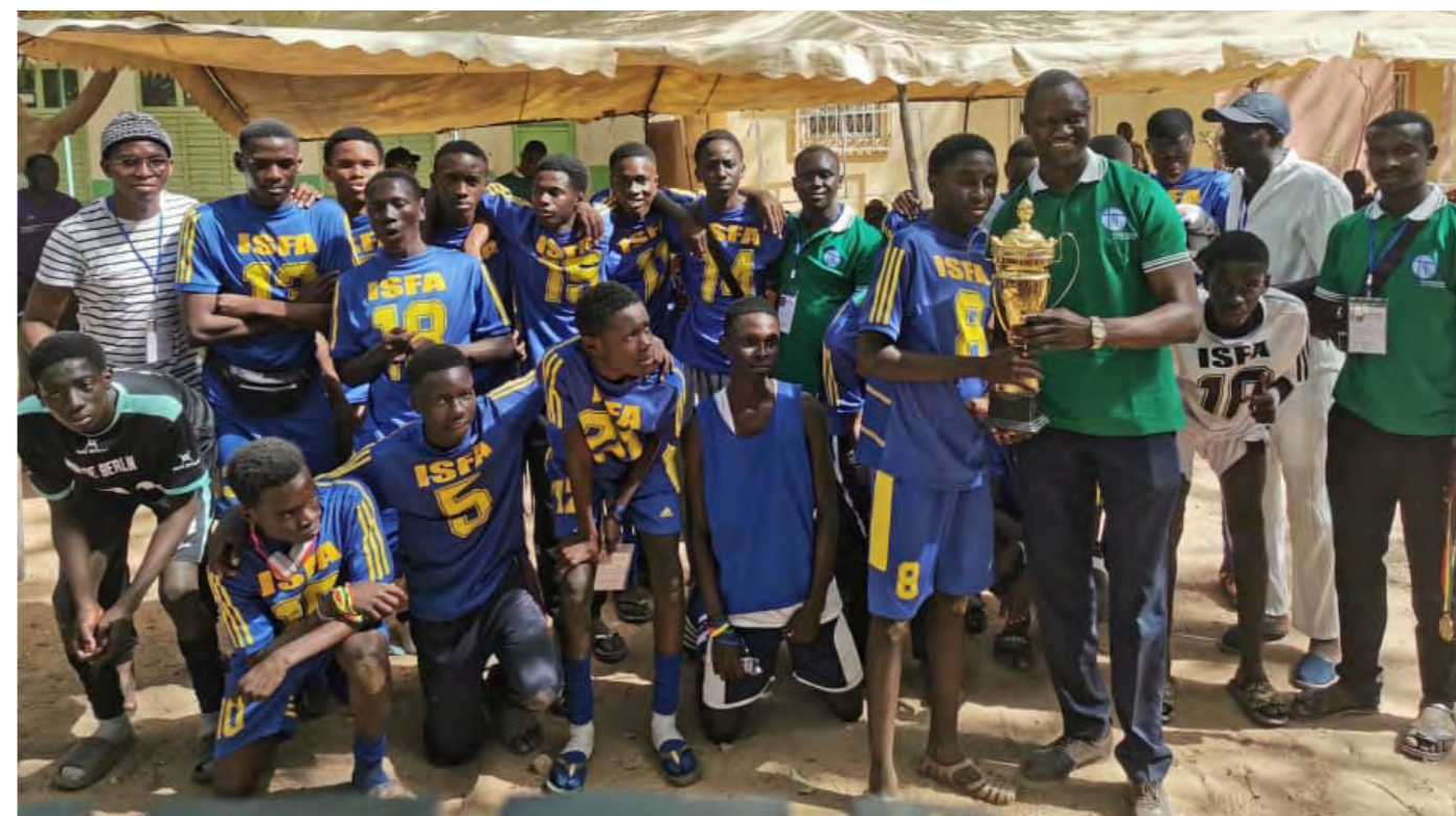
Winners - Middle school Football

We closed our sporting competitions on Sunday 5 May at 1 p.m. It was an opportunity to welcome the Provincial Superior, the guests, the Main Sponsor of the event and all sponsors and to present the trophies.