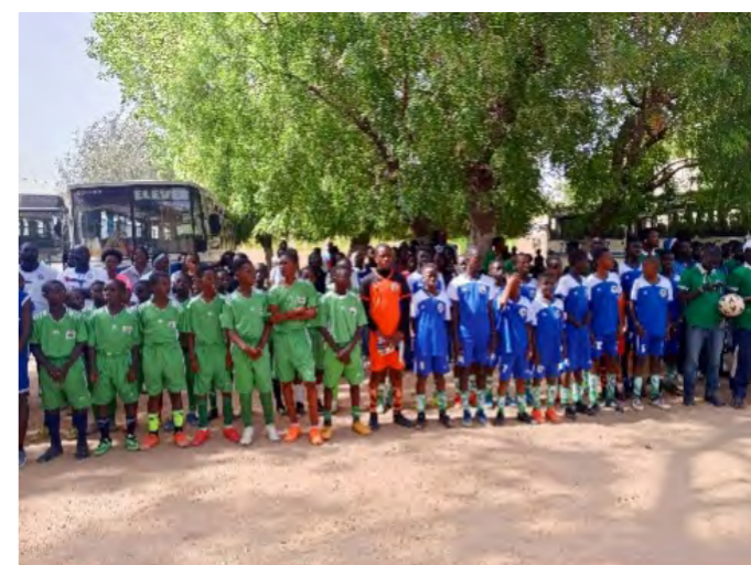
Welcoming of delegations