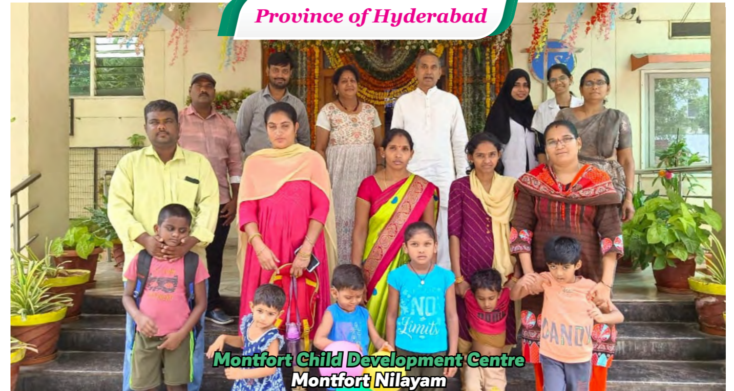
Report on Inauguration - 27 th June 2024