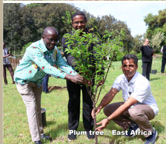
Plum tree – East Africa