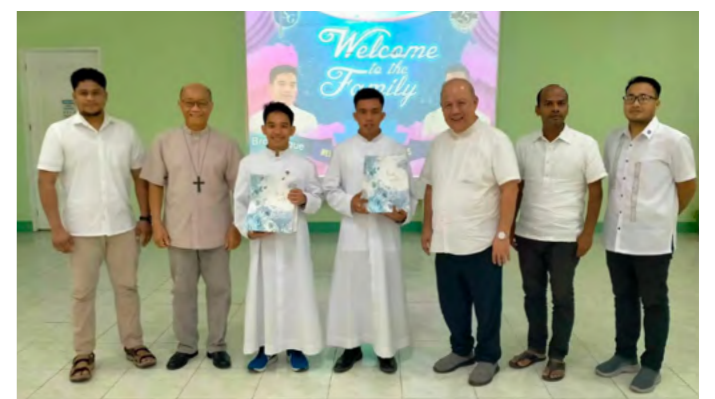
The two newly professed Brothers from Philippines with the Archbishop and other Brothers