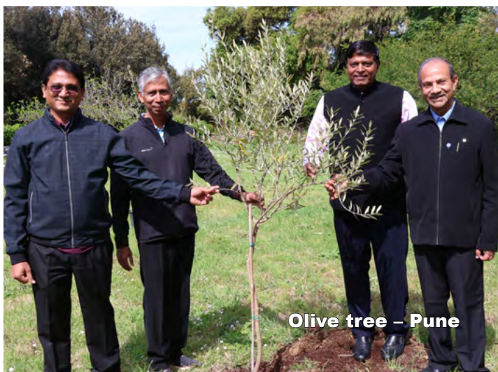
Olive tree – Pune