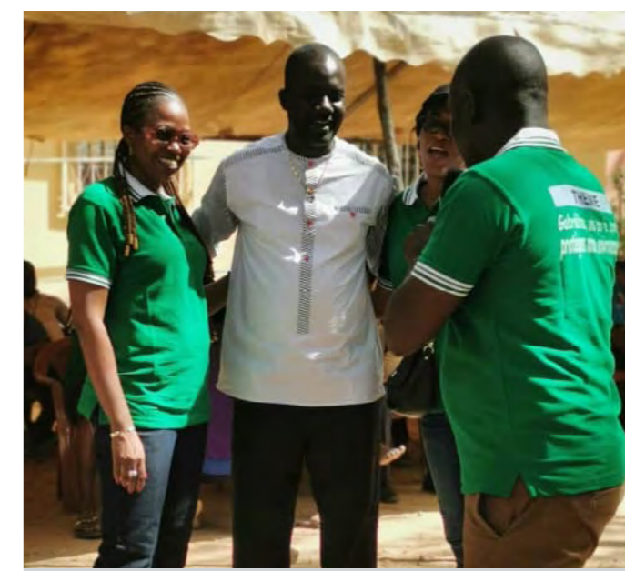
Saint Peter's Delegation