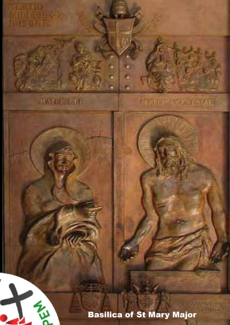
Basilica of St Mary Major