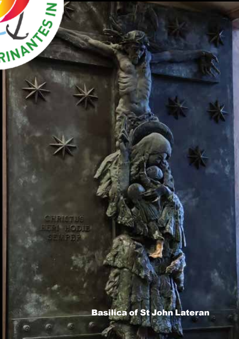
Basilica of St John Lateran