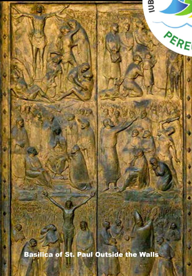
Basilica of St. Paul Outside the Walls