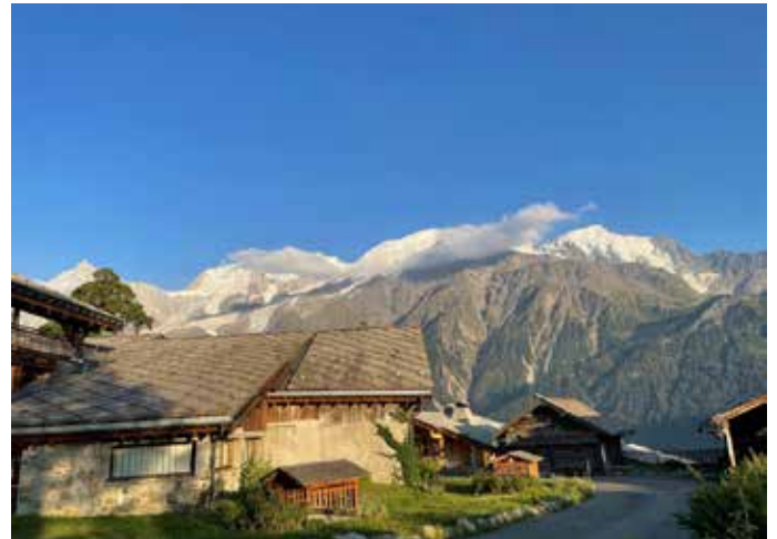
The Charity Centre of La Flatière

This Mount Tabor, not Galileo's 600 m peak, but the one in the Maurienne, near the Italian border, at over 3,000 m, was reached on two occasions, offering 360° panoramic views and time for contemplation in the little chapel perched on the summit.