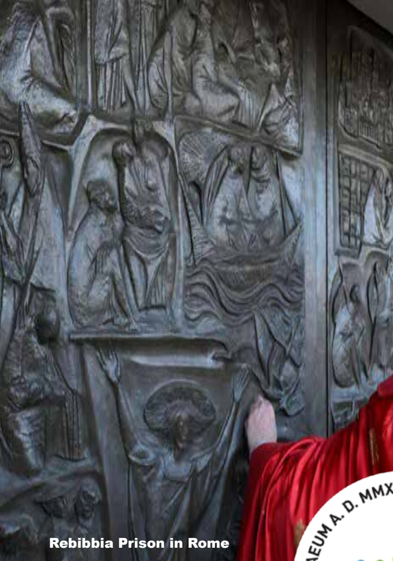
Rebibbia Prison in Rome