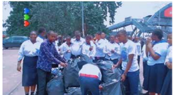
Students and teachers packing up plastic bottles.